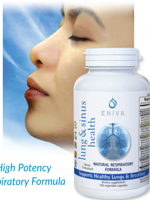
High Potency Respiratory Formula

Warning: Do not take turmeric/curcumin if pregnant/nursing, or if you have a history of gallstones/bile duct obstruction. Consult with physician before using if taking medication which may affect the ability of blood to clot, or if you are planning to have surgery.